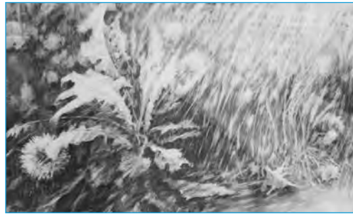
(Top left) BEST OF OIL BASED MEDIA Todd Bergert, North Canton Big Top $900.00