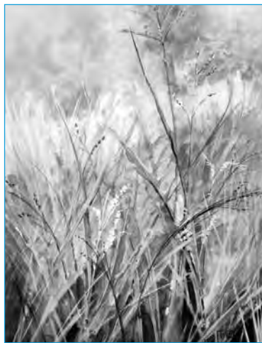
SECOND PLACE Terrie Haley, Strawberry Field